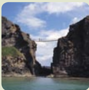
Carrick-a-Rede rope bridge